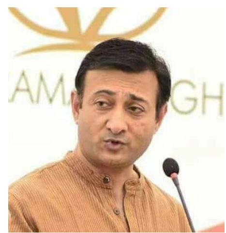
Hon'ble Industry Minister Shri Rajvardhan Singh Dattigaon

Efforts of the current regime have created a positive environment for prospective investors and entrepreneurs.