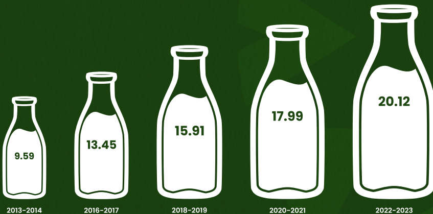
Milk Production (Measured in Million Tons)